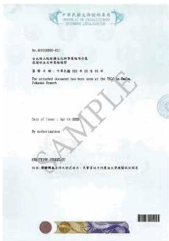
Verified Document SAMPLE

~Classes Begin~ Monday September 11, 2023