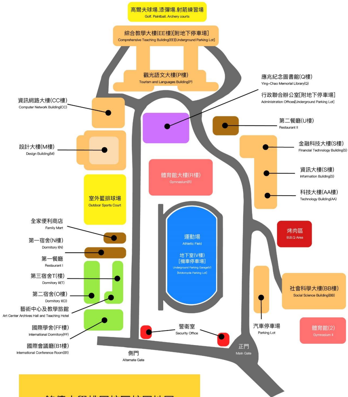
銘傳大學桃園校區校園地圖 Ming Chuan University Taoyuan Campus Map