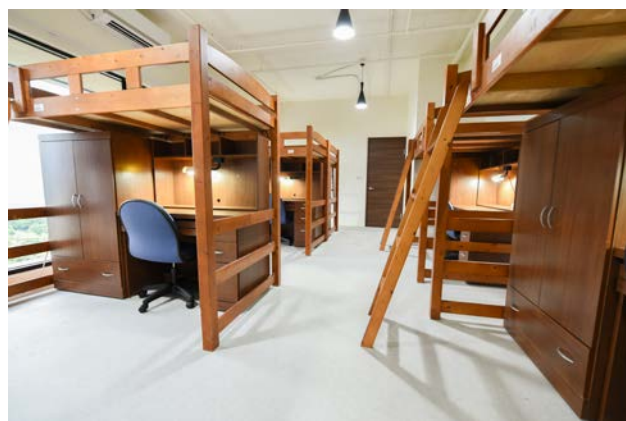
Taipei Off-campus Ji Xian Dorm 台北校外集賢宿舍

"租屋格局" select the middle option "套房", and price range "套房租金(元/月)" is possibly between NT$6,000 ~ 10,000. And, finally click on "搜尋" to start search.