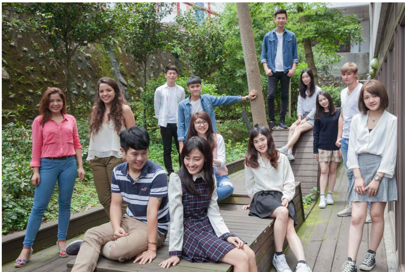
Taipei Campus 台北校區