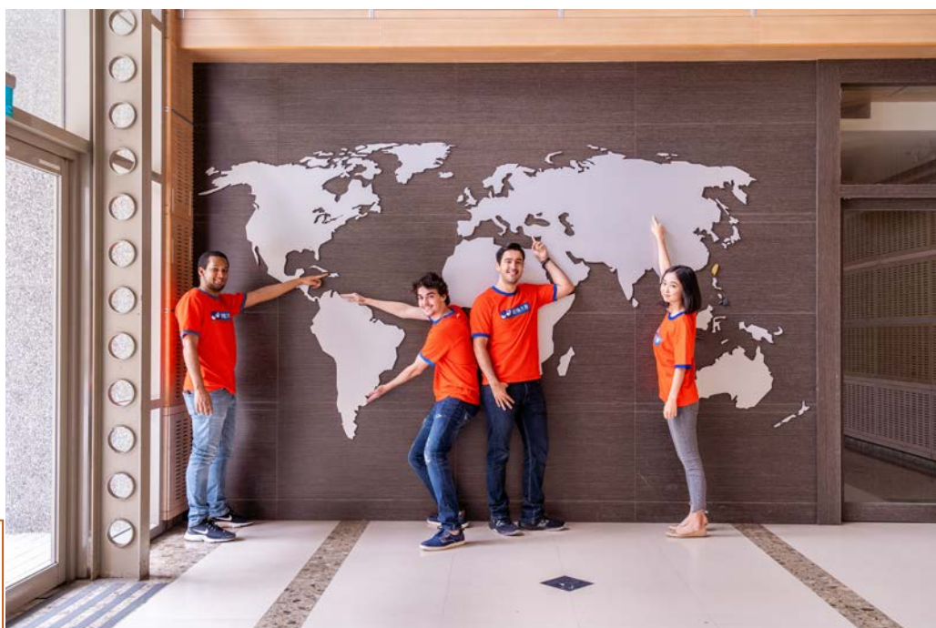
Taoyuan Campus 桃園校區

Check MCU online application system ( http://apply.mcu.edu.tw/ )