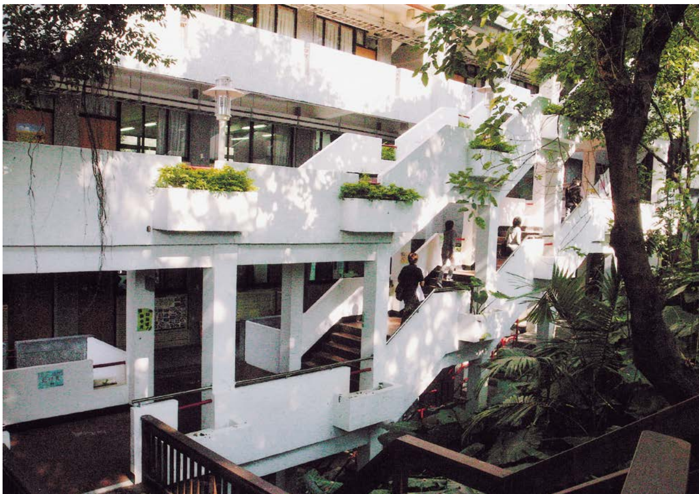
Taipei Campus 台北校區