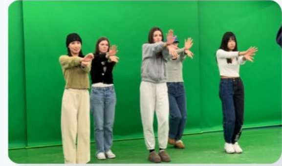
K-Pop Dance class