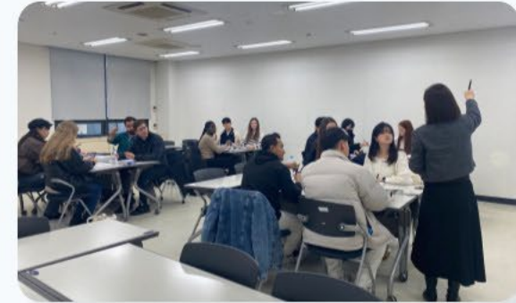
K-Beauty: Make up

Gachon University is thrilled to present an extensive range of activities for your enjoyment during the GISS Period.