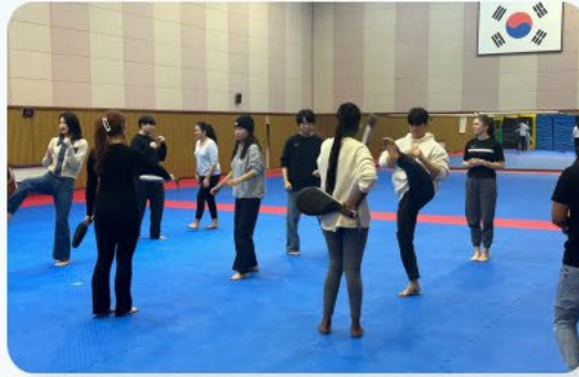
Taekwondo Basic Form