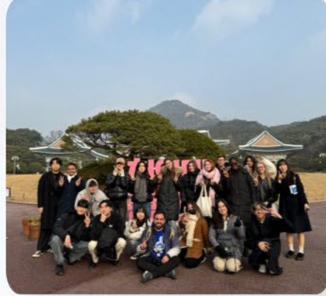
The Blue House