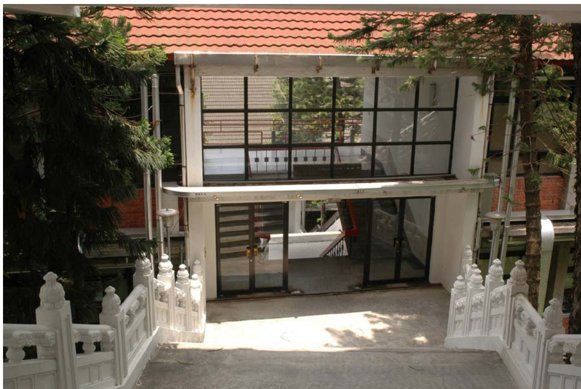
Taipei Campus 台北校區

IV Graduate admission: University/ Master's graduates Students must submit completed 3- or 4-year official English transcripts of courses from all university years.