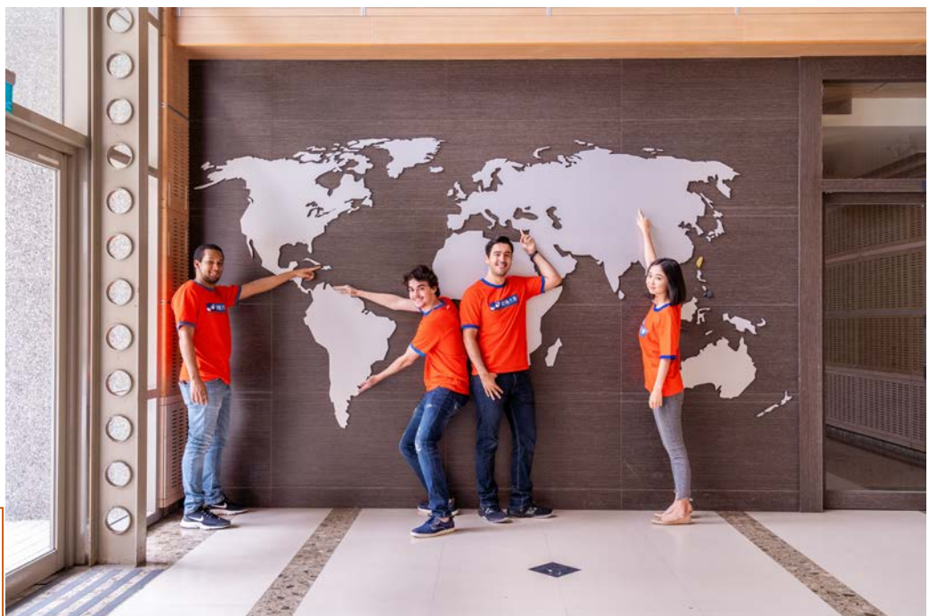
Taoyuan Campus 桃園校區

Check MCU online application system ( http://apply.mcu.edu.tw/ )