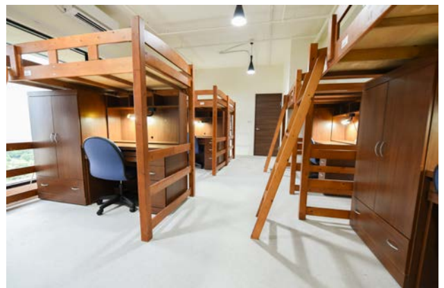
Taipei Off-campus Ji Xian Dorm 台北校外集賢宿舍

"租屋格局" select the middle option "套房", and price range "套房租金(元/月)" is possibly between NT$6,000 ~ 10,000. And, finally click on "搜尋" to start search.