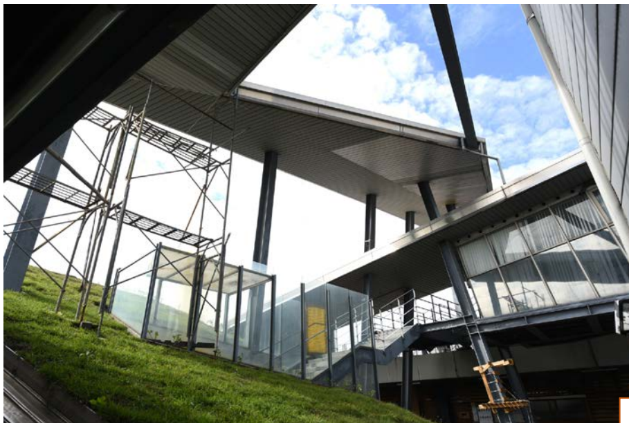
Design Building, Taoyuan Campus 桃園校區設計大樓

Ming Chuan University Website: https://gad.mcu.edu.tw/en/transport-and-map-en/