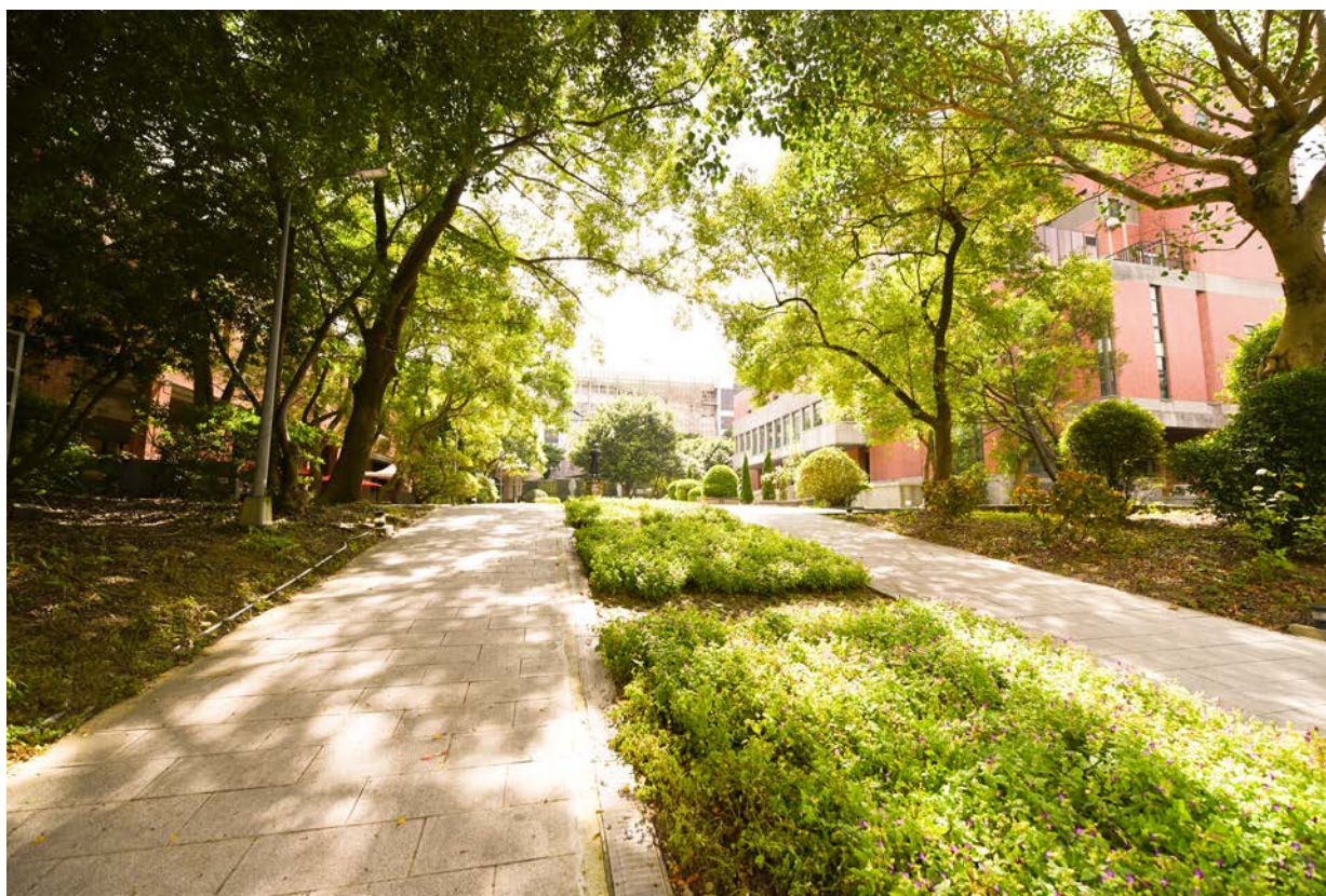
Taoyuan Campus 桃園校區