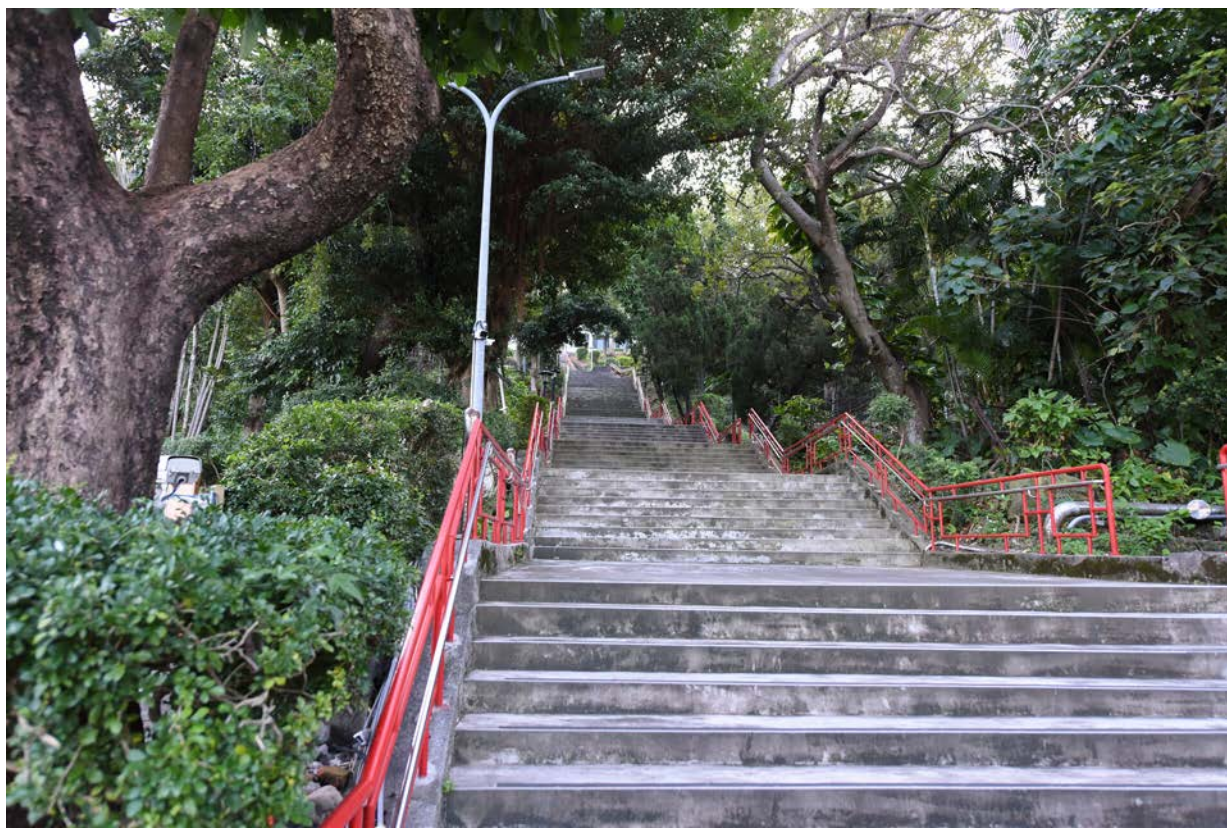
Taipei Campus 台北校區