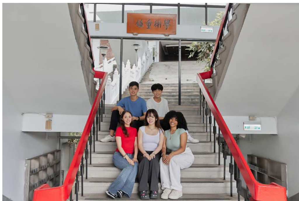
Taipei Campus 台北校區