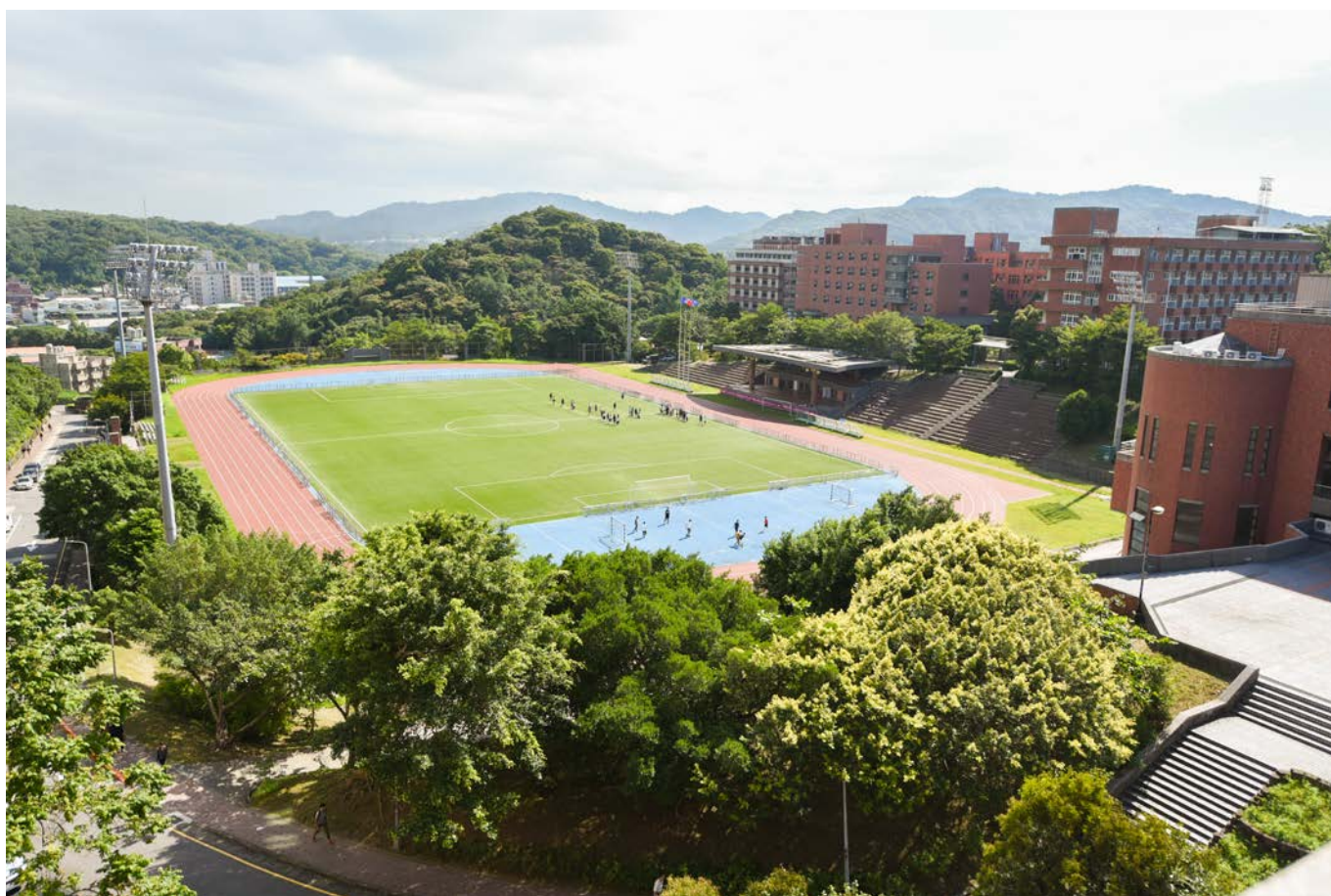
Taoyuan Campus 桃園校區