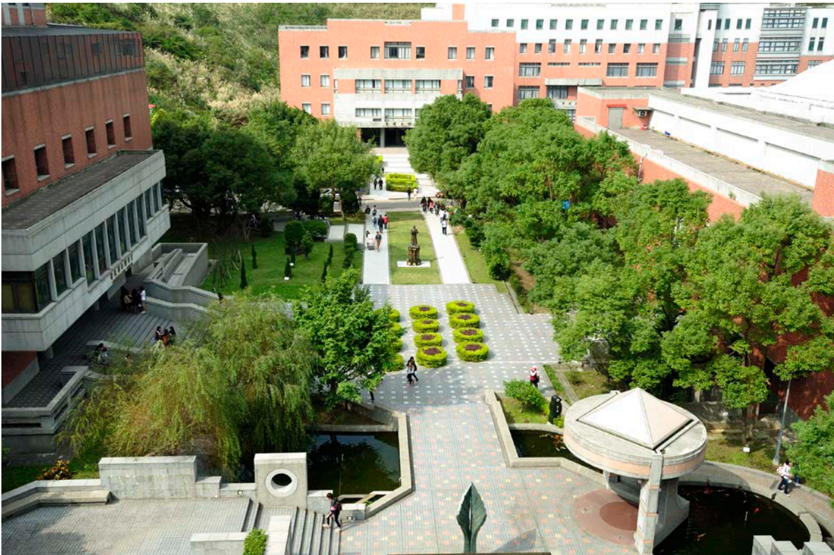
Taoyuan Campus 桃園校區

Academic programs: https://web2.mcu.edu.tw/en/teaching-unit/