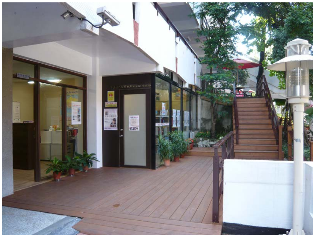
SISS Taipei office