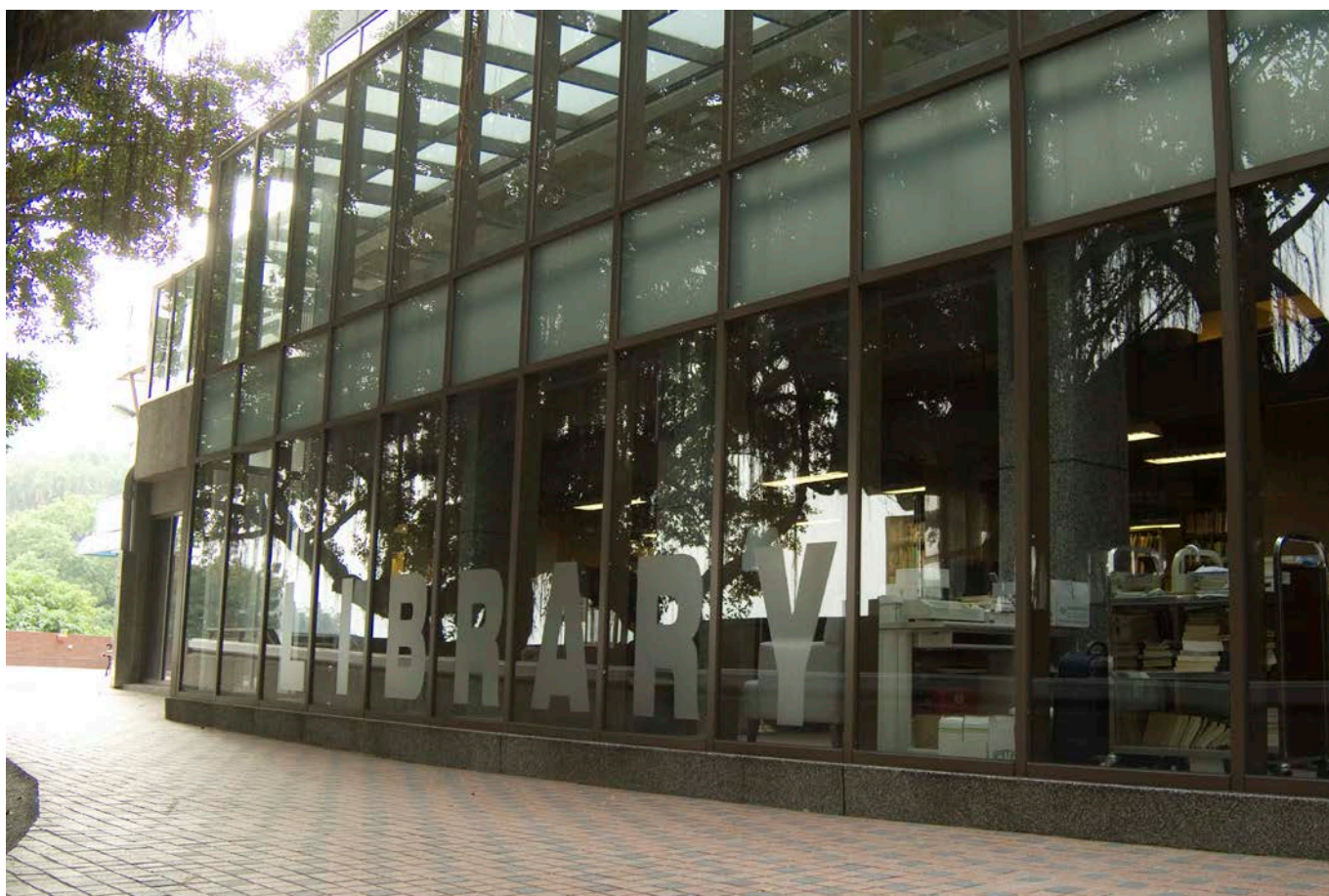
Taipei Campus 台北校區