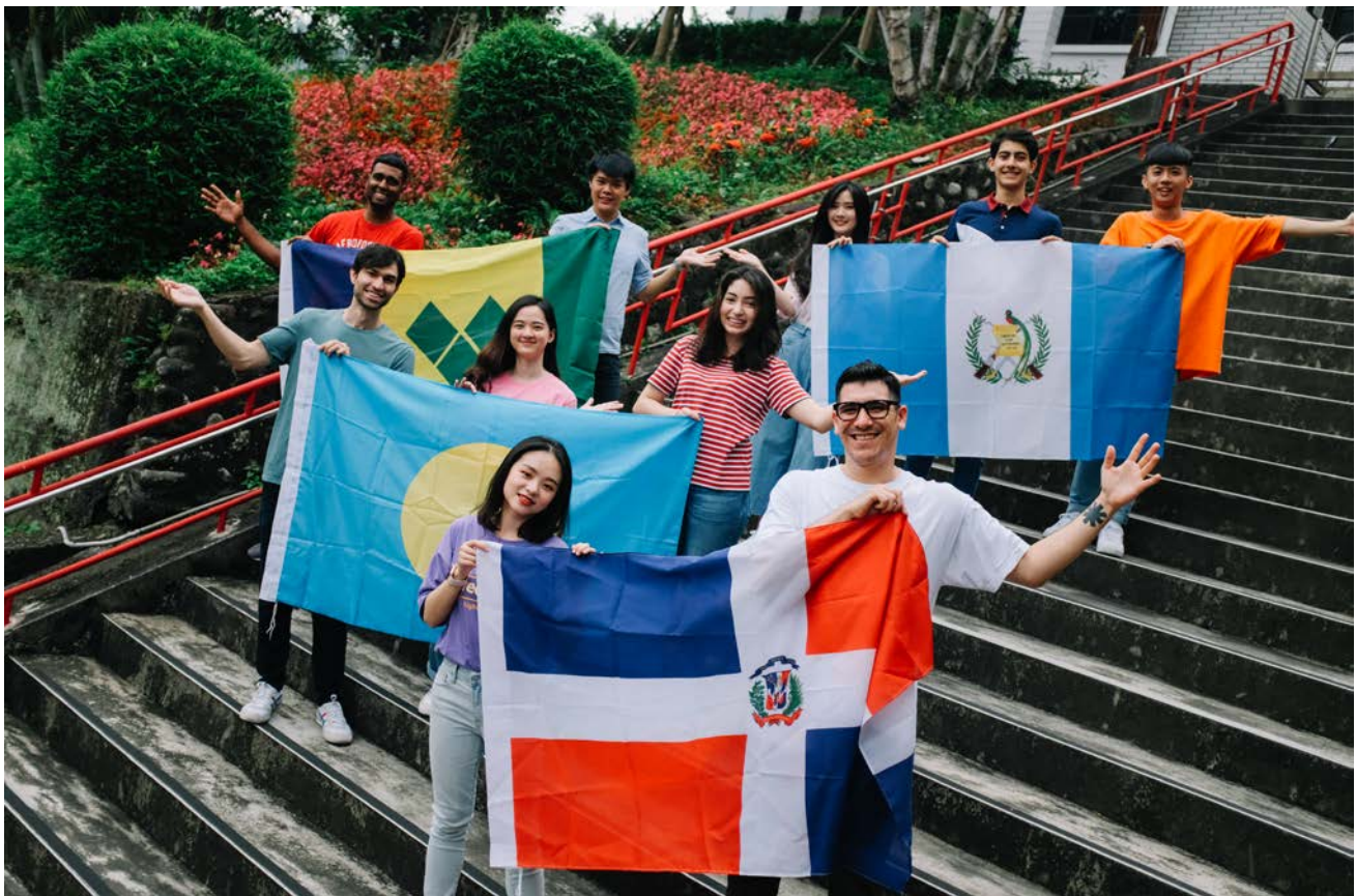
Taipei Campusw 台北校區

Transfer applicants admitted at the highest level is the junior year.