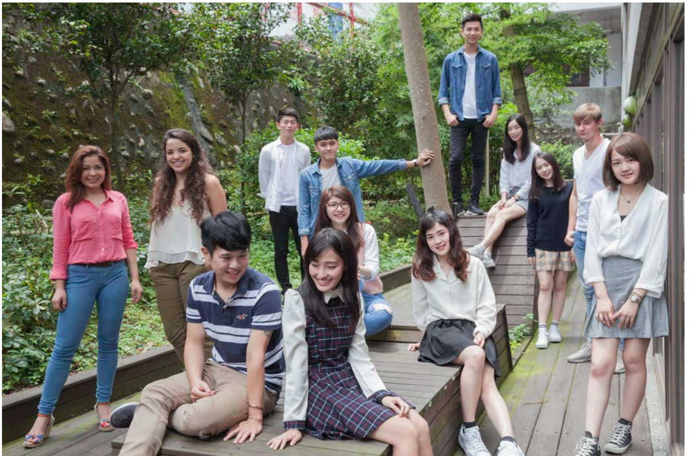
Taipei Campus 台北校區