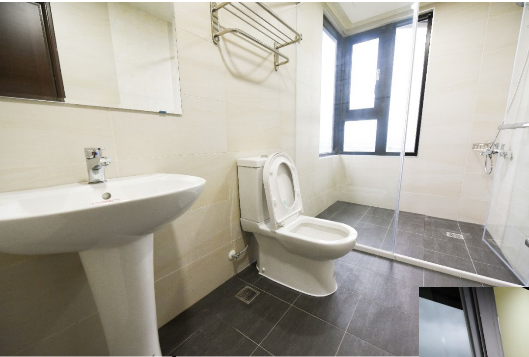
Toilet/ Shower in each room