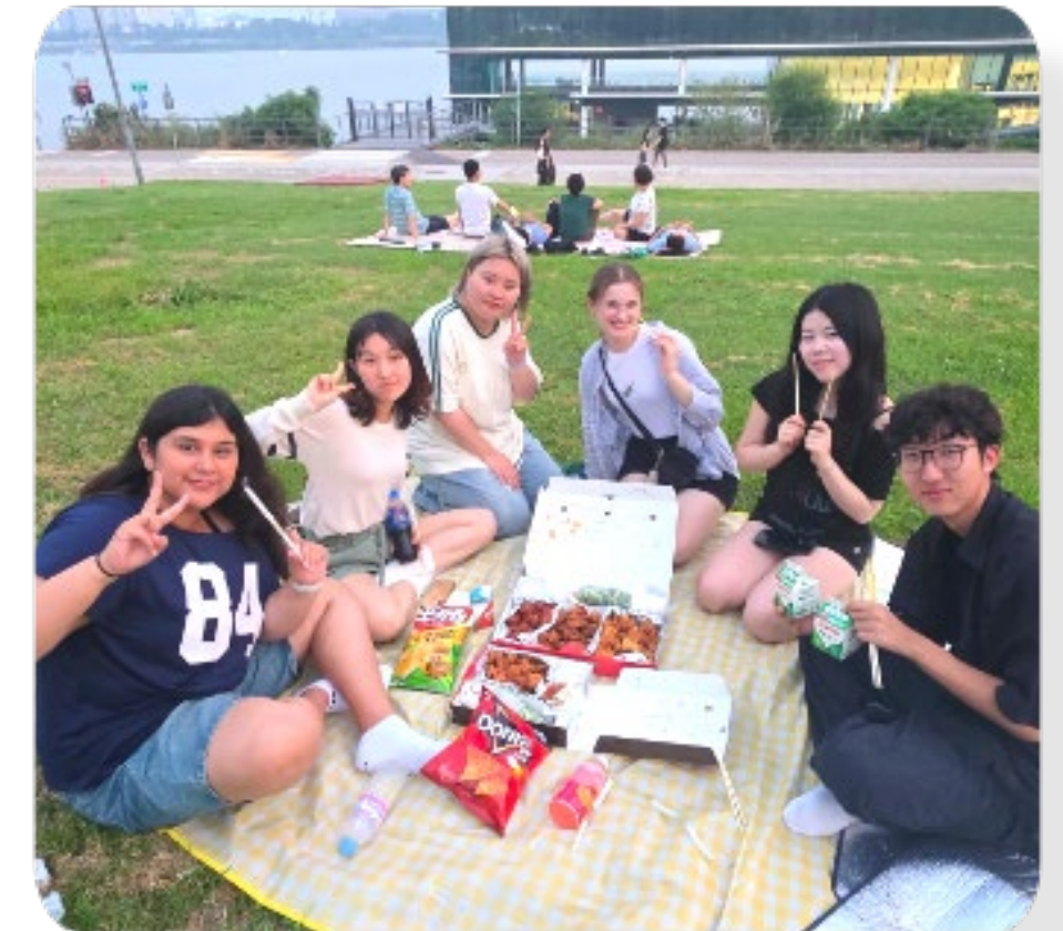
Group Free Tour