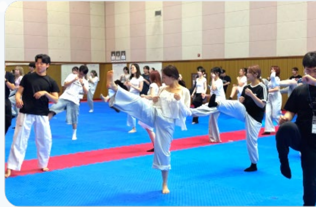
Taekwondo Basic Form